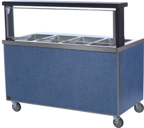
TWHF-46PG (shown with optional foodshield)