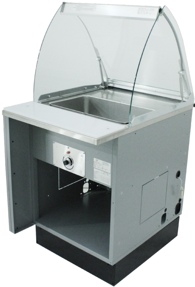
251064 - 25" Standard - Left