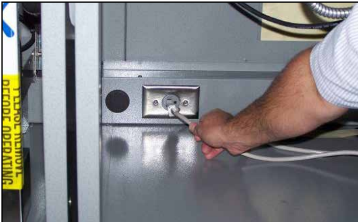
HOT FOOD UNIT

Unplug the power for the unit you are working on. This will disconnect the power to the lights.