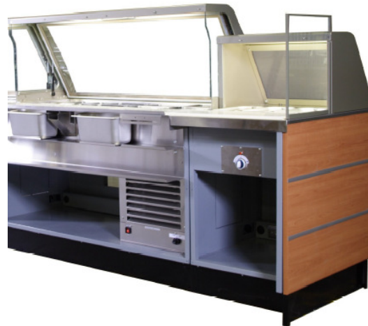
Above unit shown with Right Hand unit with optional End Panel